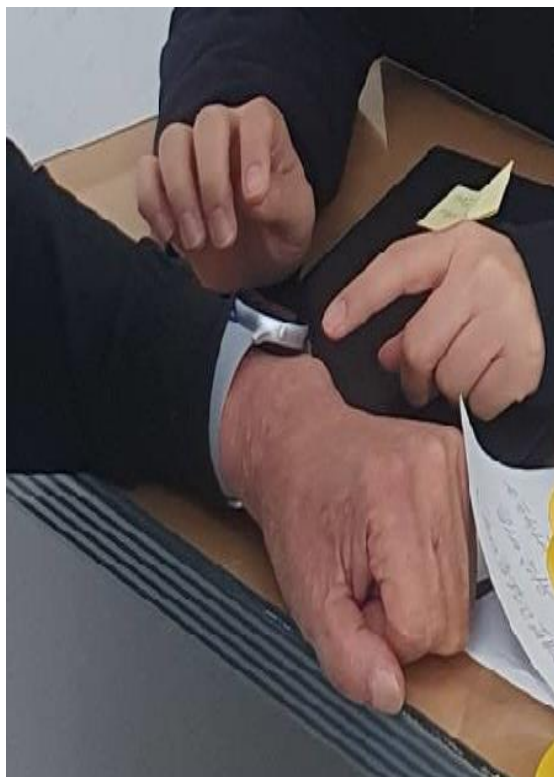
Health management using smartwatch