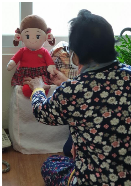
AI care robots and speakers promoting paradigm shift in next-generation care services in 2019-2020