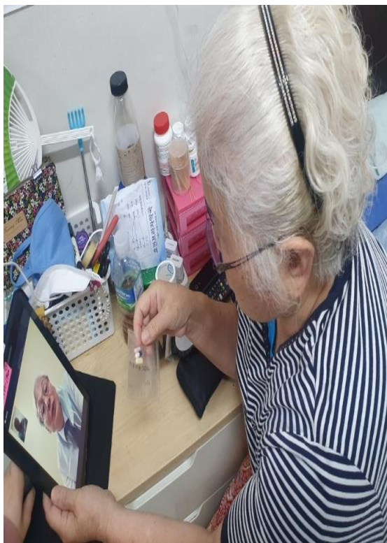
non-face-to-face video call care service