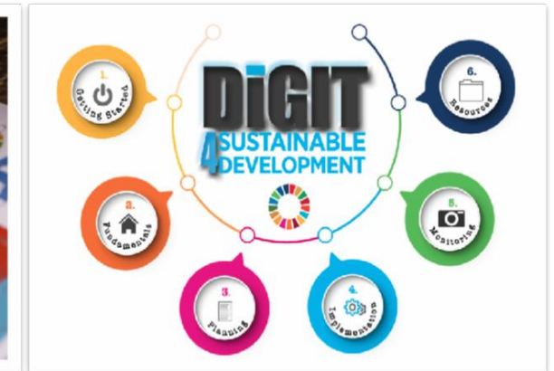
DiGIT4SD: Digital Government Implementation