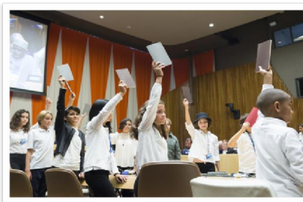
Government Innovation for Social Inclusion of Vulnerable Groups