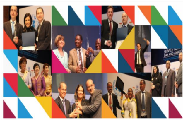
Innovation and Digital Government for Public Service Delivery