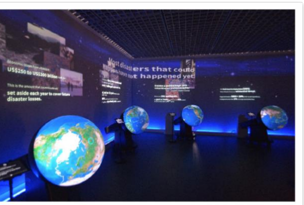
Risk-informed Governance and Innovative Technology for Disaster Risk Reduction and Resilience