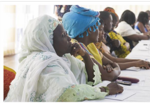
Institutional Arrangements and Governance Capacities for Policy Coherence