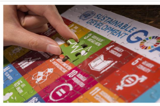
Integrated Policies and Policy Coherence for the SDGs