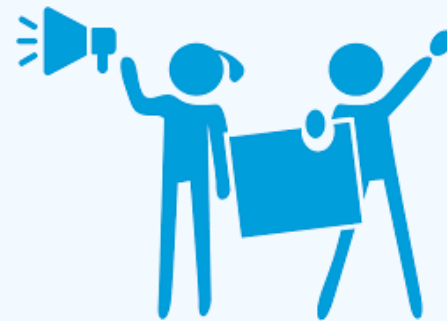
Human Rights-Based Approach