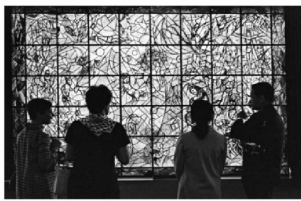
Transparency, Accountability and Ethics in Public Institutions