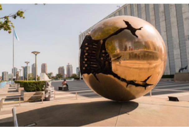
Changing Mindsets in Public Institutions to Implement the 2030 Agenda for Sustainable Development