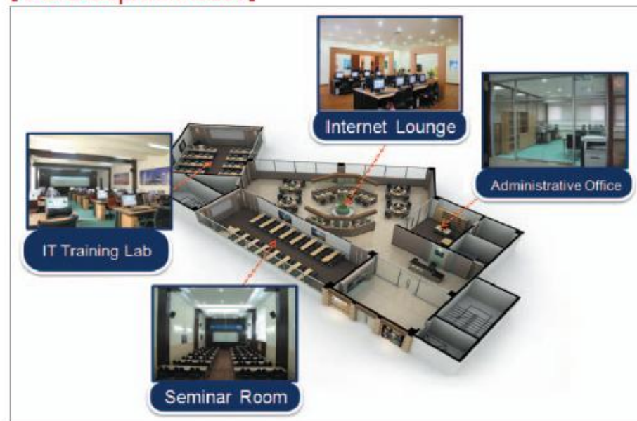
[ IAC Blueprint Model ]